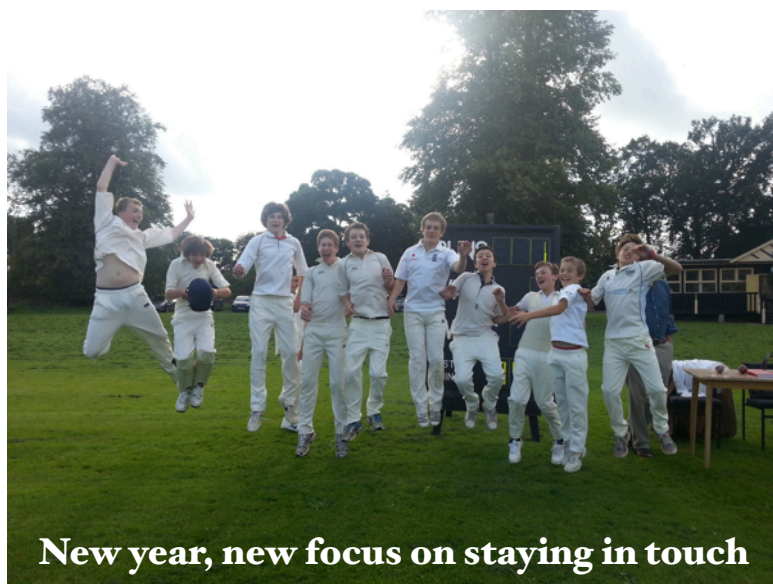
New year, new focus on staying in touch